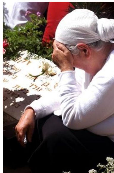
Jewish woman grieving over the loss of a loved one

Jerusalem may still be full of strife as nations fight and argue over who will get a piece of her; and much weeping goes on because of the continual terrorist attacks in Jerusalem; but God's Word promises that one day, the people of Israel will truly rejoice, and no longer weep on the streets.