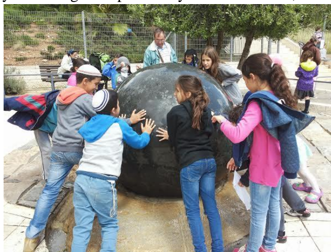
Israeli children trying to move rock on display at Jerusalem Science museum

" Adonai ...declares: 'I am going to make Jerusalem a cup that sends all the surrounding peoples reeling. Judah will be besieged as well as Jerusalem. On that day, when all the nations of the earth are gathered against her, I will make Jerusalem an immovable rock for all the nations. All who try to move it will injure themselves'" (Zechariah 12:2-3).