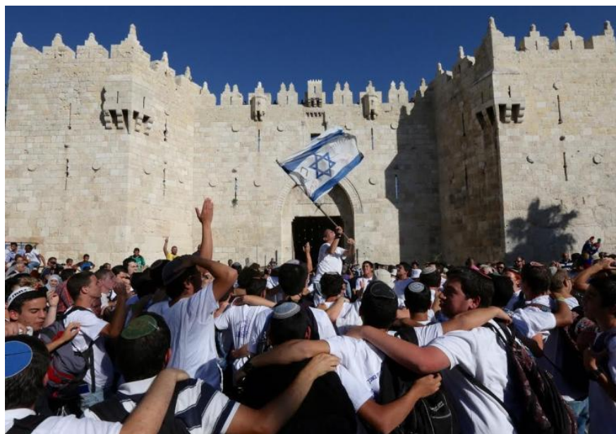
Jewish youth gather outside Damascus gate on 'Jerusalem Day,' May 17, 2015

There, great celebrations are held including speeches by Israeli dignitaries; and joyful music, dancing and singing. The large majority of people (mainly youth) who participated in this march are not demonstrating against the Arabs; but rather sing and dance joyfully because of their love for this special city - Jerusalem.