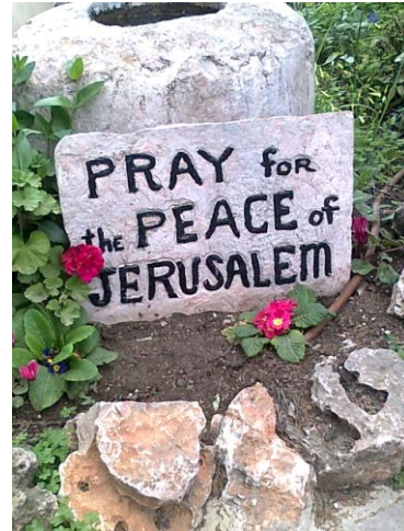
Sign at Garden Tomb, Jerusalem

May you be blessed and prosper, you who love Jerusalem and Zion.