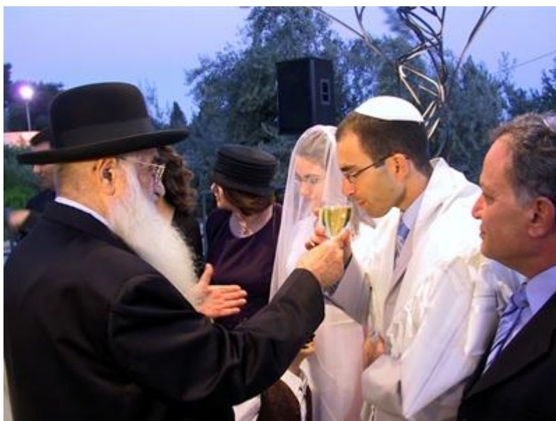
Jewish wedding

There will come a day when God will restore all things: "A song shall be heard in the cities of Judah and in the streets of Jerusalem. A voice of joy and a voice of gladness; a voice of the bride and a voice of the bridegroom." (Jeremiah 33:11)