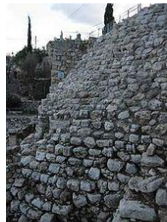
Stepped Stone Structure in Ophel/City of David

Jerusalem has been destroyed by conquering nations and re-built forty times! In fact, the Old City of Jerusalem today sits upon hundreds of feet of rubble – the ruins of its former destruction.