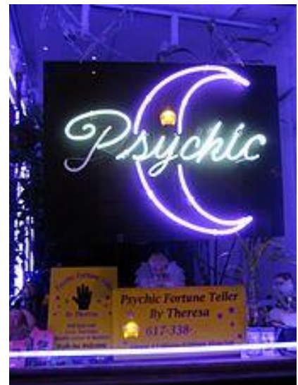
Storefront psychic fortune-teller in Boston

“No one among you is to make his son or daughter pass through the fire, practice divination, tell fortunes, interpret omens, practice sorcery, cast spells, consult a medium or a familiar spirit, or inquire of the dead. Everyone who does these things is detestable to the LORD,” (Deuteronomy 18:10)