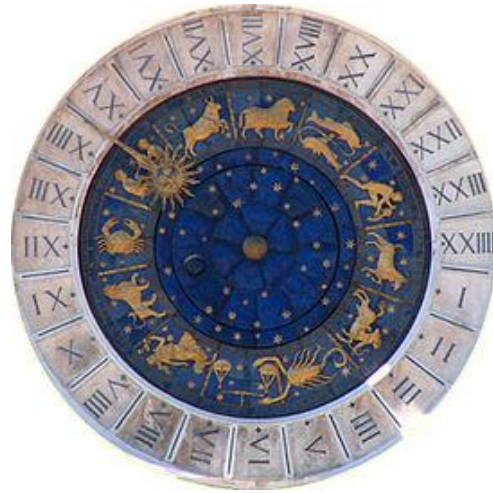
The Astrological signs

God acknowledges that pagans participate in the occult but these practices are forbidden for any of God's people. Receiving guidance from one's astrological chart, reading palms or tea leaves, attending séances or even using Ouiji boards are all not permitted for people of God; and yet many today (either in ignorance or defiance of the law) read books about wizards and dabble in the occult. Although some consider these harmless, according to God's Word this is a dangerous spiritual path.