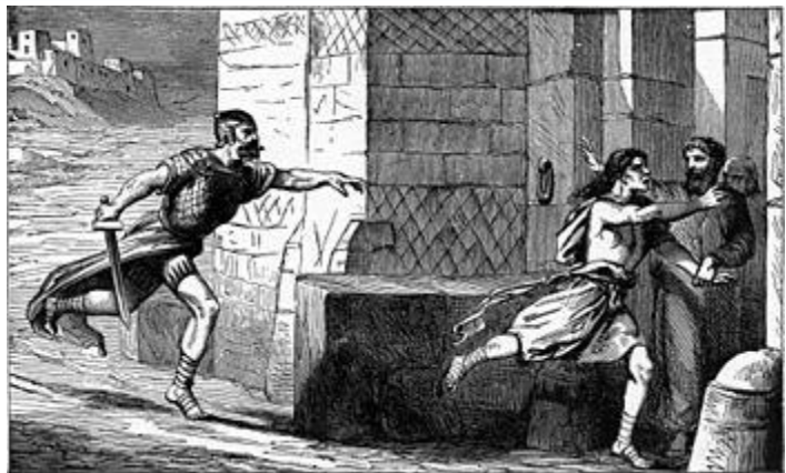
The City of Refuge (illustration from the 1897 Bible Pictures and What They Teach Us by Charles Foster)

“This is the rule concerning anyone who kills a person and flees there for safety—anyone who kills a neighbor unintentionally, without malice aforethought.” (Deuteronomy 19:4)