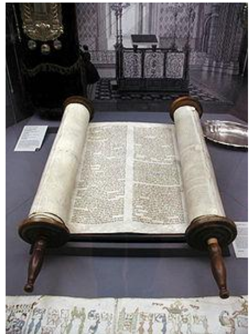
Sefer Torah at old Glockengasse Synagoge, Cologne

King Josiah knew that God's judgment was about to fall upon Israel for not obeying the words of His Torah and not living according to it; but because the king humbled himself, tore his robes and wept in repentance, God promised not to execute His judgment during Josiah's reign.