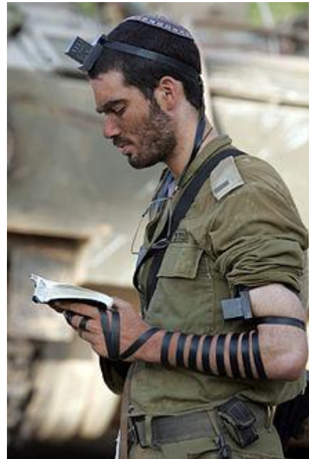
IDF soldier put on tefillin and prays.

“When you are about to go into battle, the priest shall come forward and address the army. He shall say: “Hear, Israel: Today you are going into battle against your enemies. Do not be fainthearted or afraid; do not panic or be terrified by them. For the LORD your God is the one who goes with you to fight for you against your enemies to give you victory.” (Deuteronomy 20:2-4)