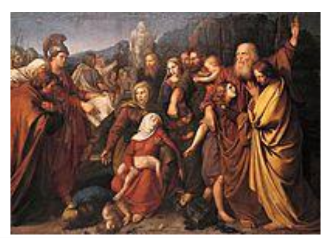
Wojciech Stattler's "Machabeusze" ("The Maccabees"), 1844

How do the Maccabees speak into our lives today? I believe they stand as an example for us in these end times. These few brave men stood against the crowd to defy all the ungodliness of their day in defense of the One True God and their faith. In doing so, they rebelled against not only the Syrian-Greek-Hellenistic oppressors; but also against the ungodly, compromising, humanistic government and population of their own people, Israel.